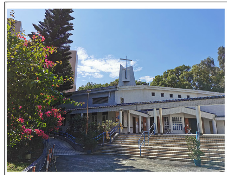
LR6.3 CATHOLIC DIOCESE OF HONG KONG MOTHER OF CHRIST CHURCH