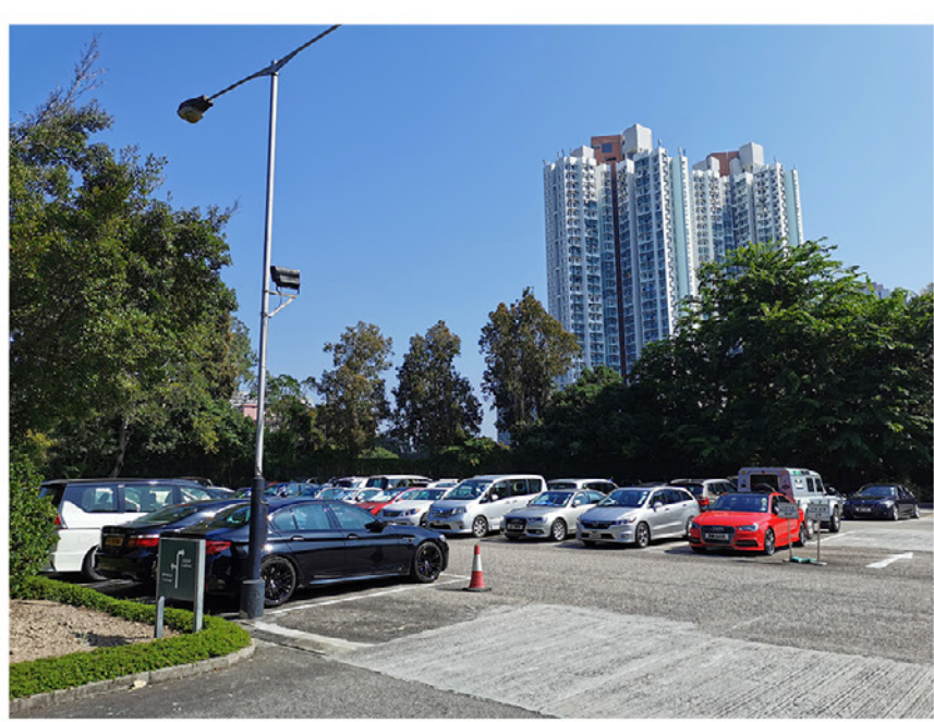
LR8.2 CARPARK IN GOLF COURSE