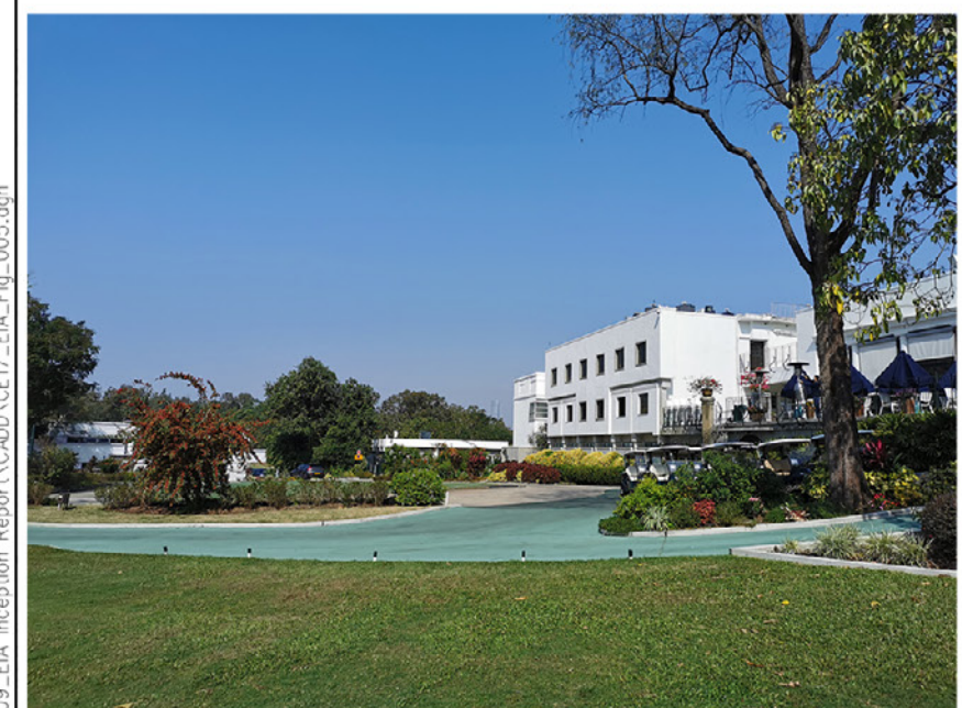
LR8.1 GOLF CLUB BUILDING