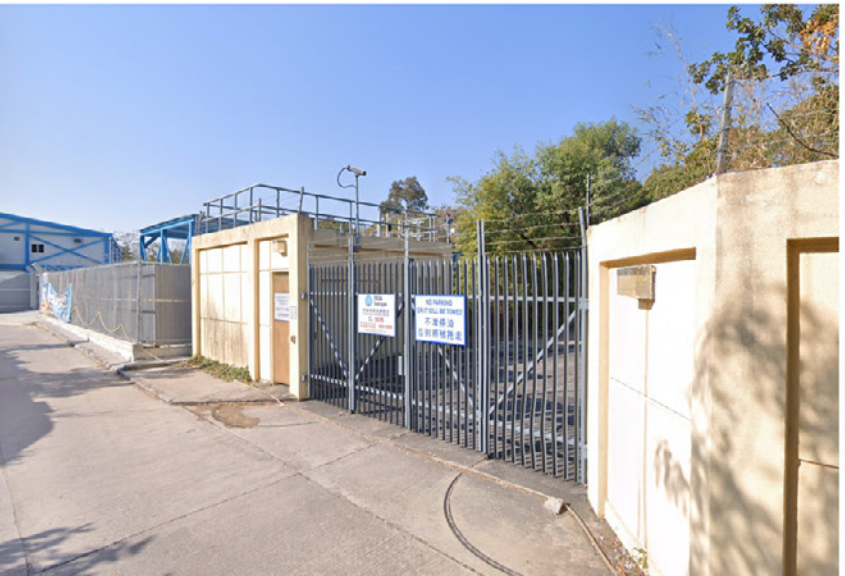
LR10 TOWNGAS OFFTAKE STATION, WATERWORK DEPOT AND OPEN STORAGE YARDS