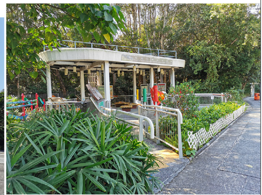
LR9.1 NORTH DISTRICT EQUESTRIAN EVENTS MEMORIAL GARDEN