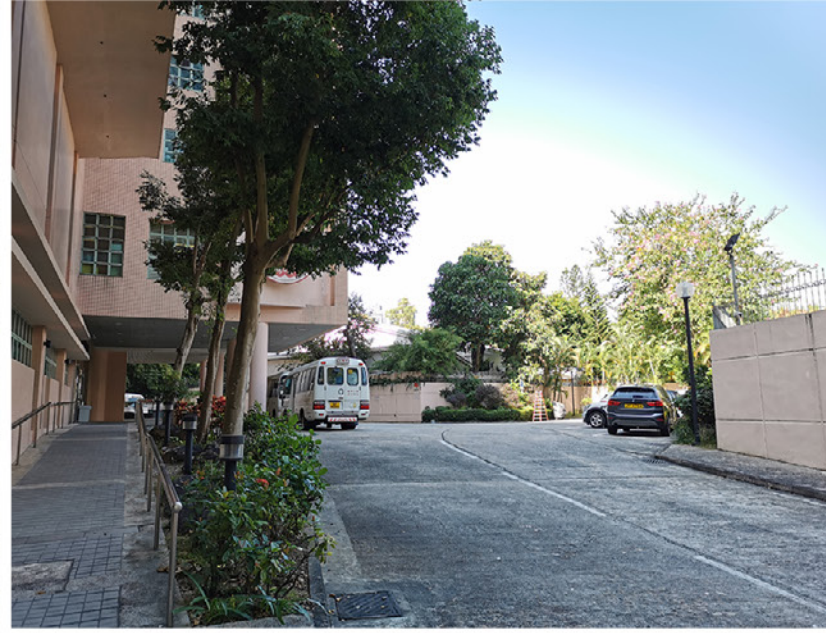
LR6.4 BUDDHIST LI CHONG YUET MING NURSING HOME FOR THE ELDERLY