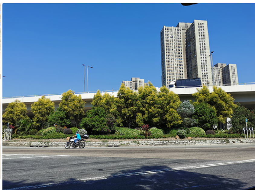
LR11.1 FANLING HIGHWAY